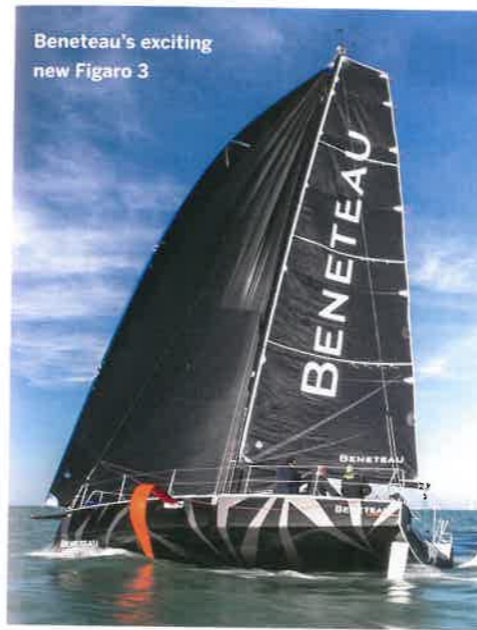
Beneteau's exciting new Figaro 3