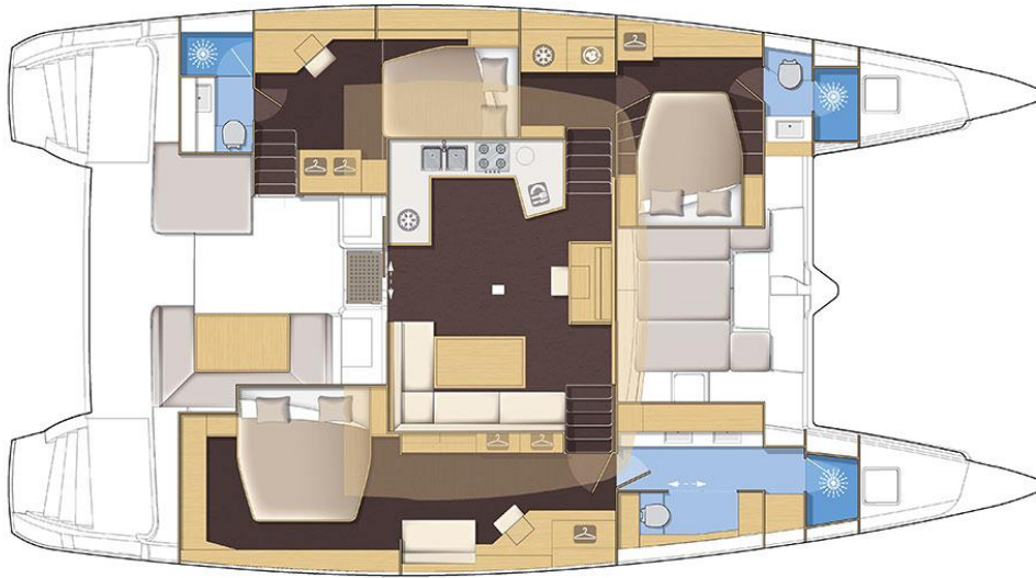
Version 3 cabins / 3 cabin version