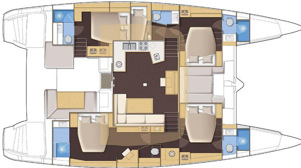
Version 5 cabines / 5 cabin version