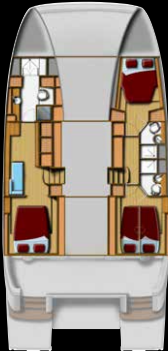
3 Cabin Layout